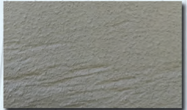
COOL-TEC™ Wood Application