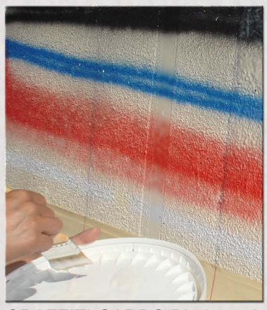
Spray paint graffiti applied to GRAFFITI GARD® Biodegradable stripper applied one week after graffiti application.