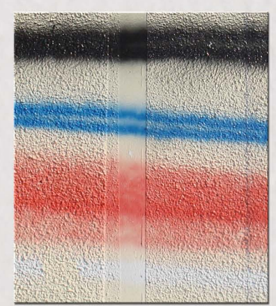
surface with GRAFFITI GARD® IV Low Luster.