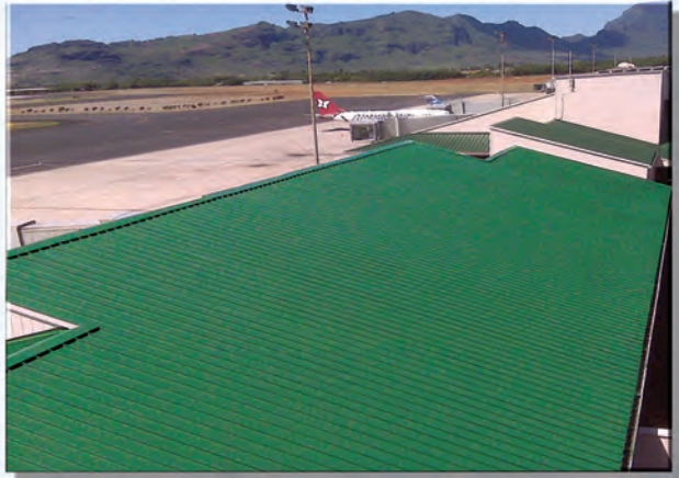
Kauai Lihue International Airport - Hawaii