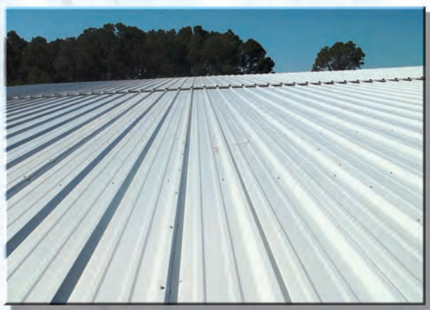
Increased Reflectivity - Even in Light Colors!