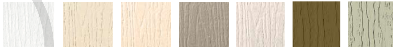
White Ivory Beige Adobe Desert Sand Brown Wheat

With a palette of designer colors*, it is easy to design a cover that perfectly complements your home. Even consider mixing and matching two of our lattice colors to accentuate the various colors of your home.