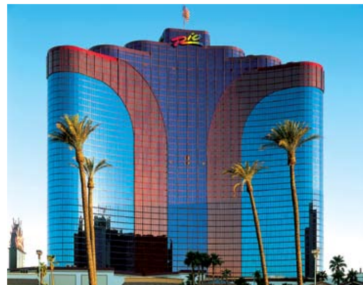
Architects around the world specify Kynar 500™ resin based coatings because of its ability to withstand the rigors of nature and time. This high performance coating system has an extraordinary capability to retain color and gloss, and keeps painted metal looking vibrant and appealing for years to come.